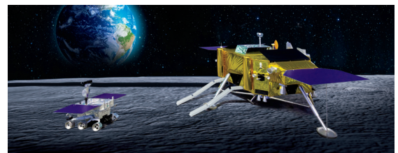
China lands on the far side of the Moon – Jan. 2, 2019.